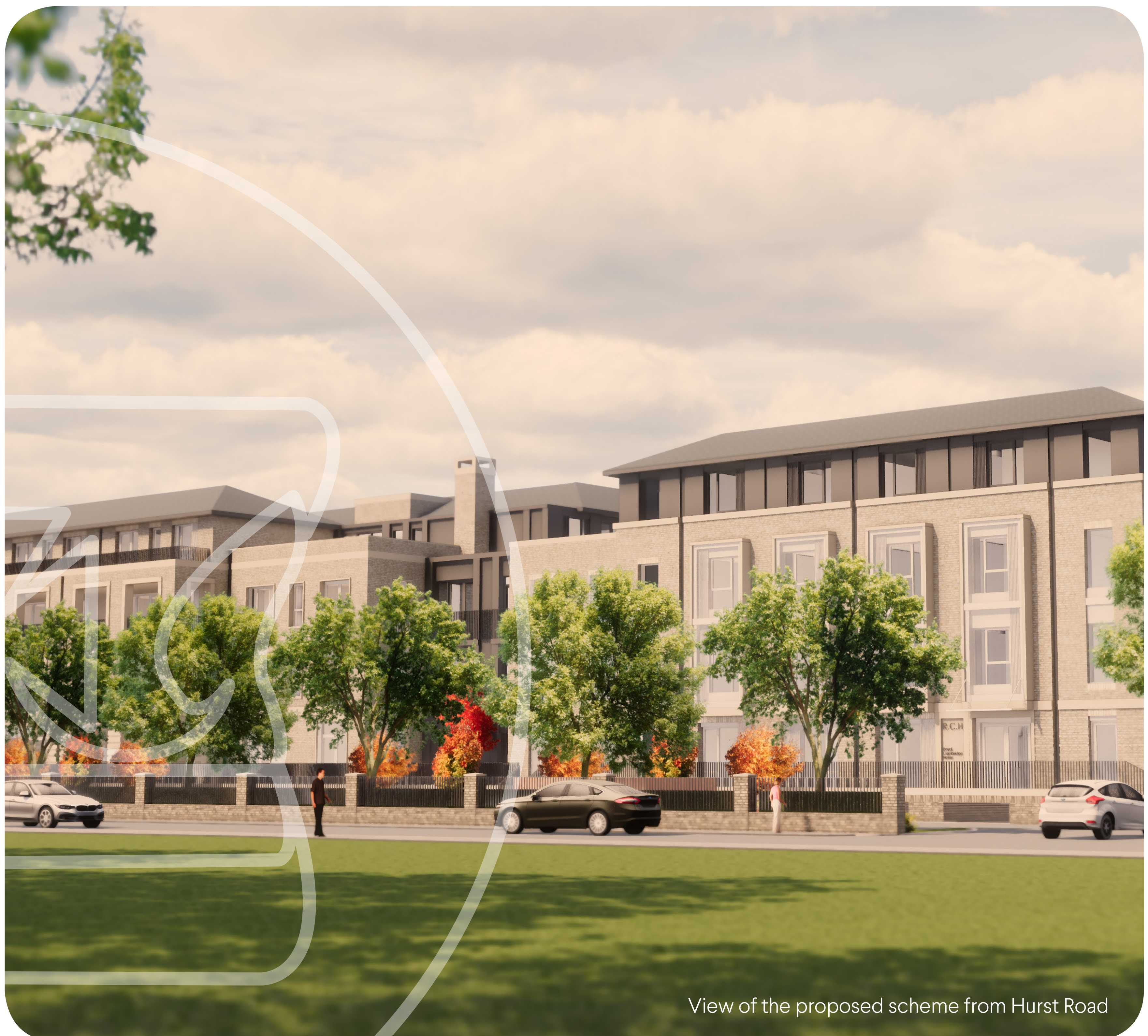
View of the proposed scheme from Hurst Road