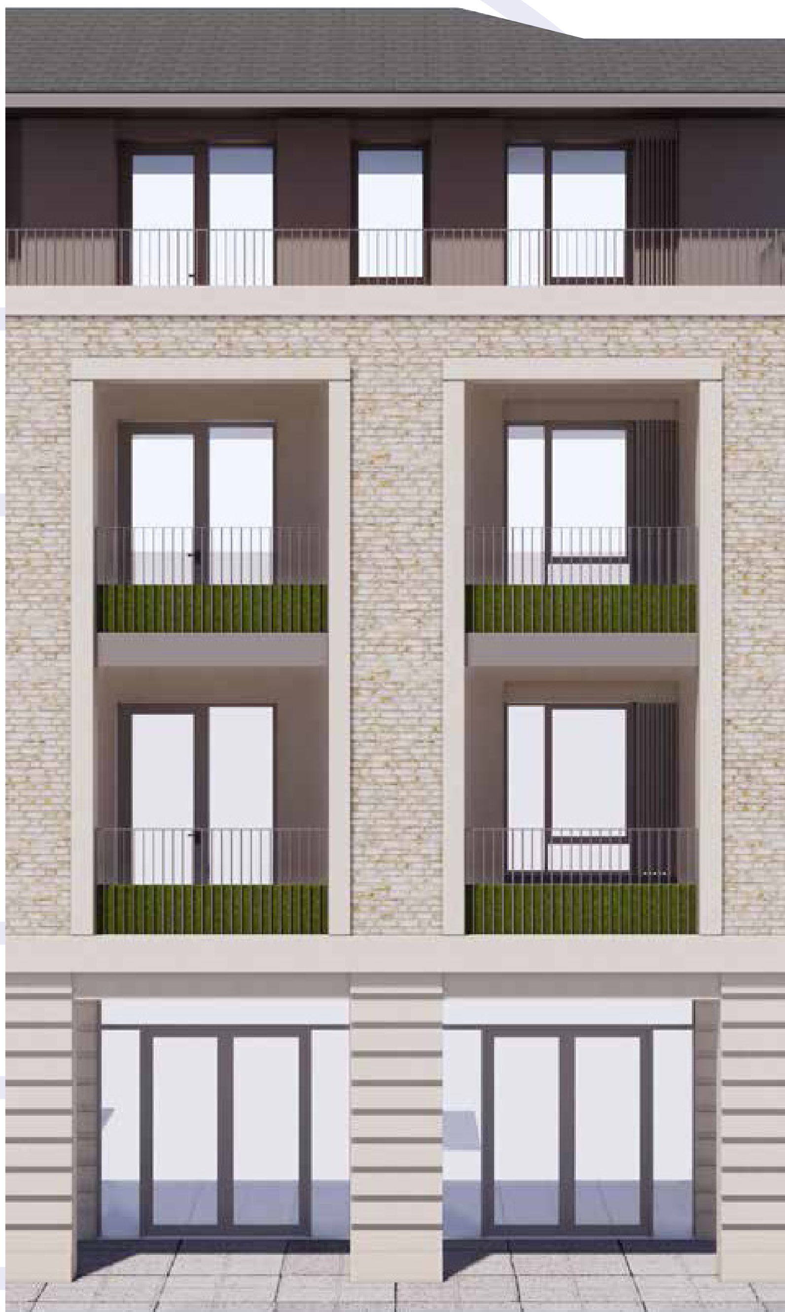
View of proposed external brickwork with stone banding and detailing

As can be seen from the image below, it is proposed that the buildings are constructed in a light coloured brick and a style which is in keeping with the local aesthetic.