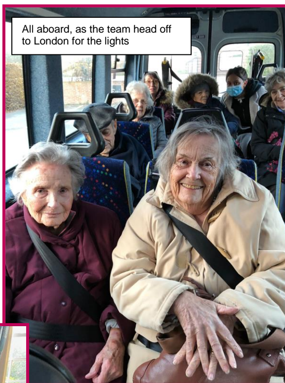
All aboard, as the team head off to London for the lights