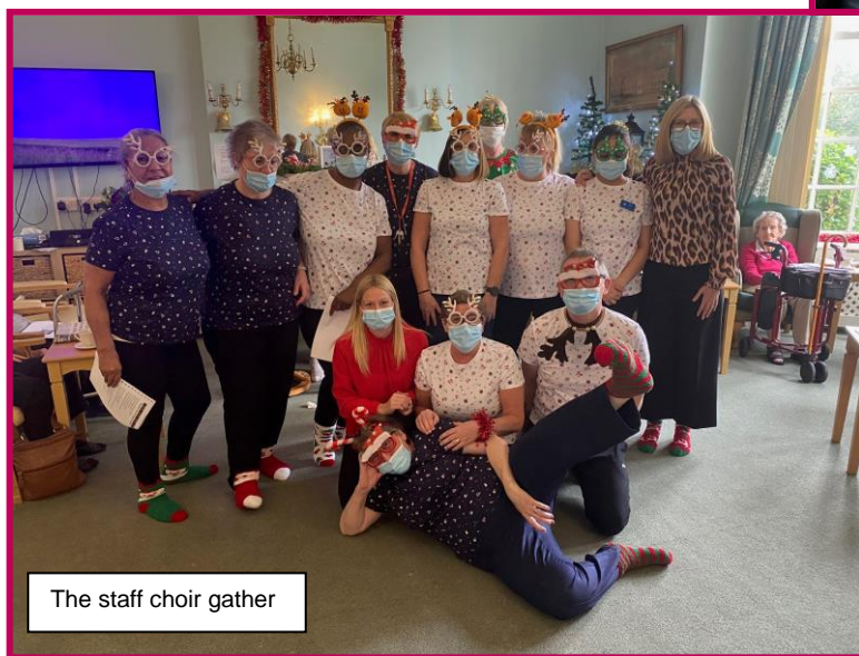
The staff choir gather