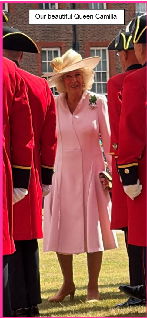
Our beautiful Queen Camilla