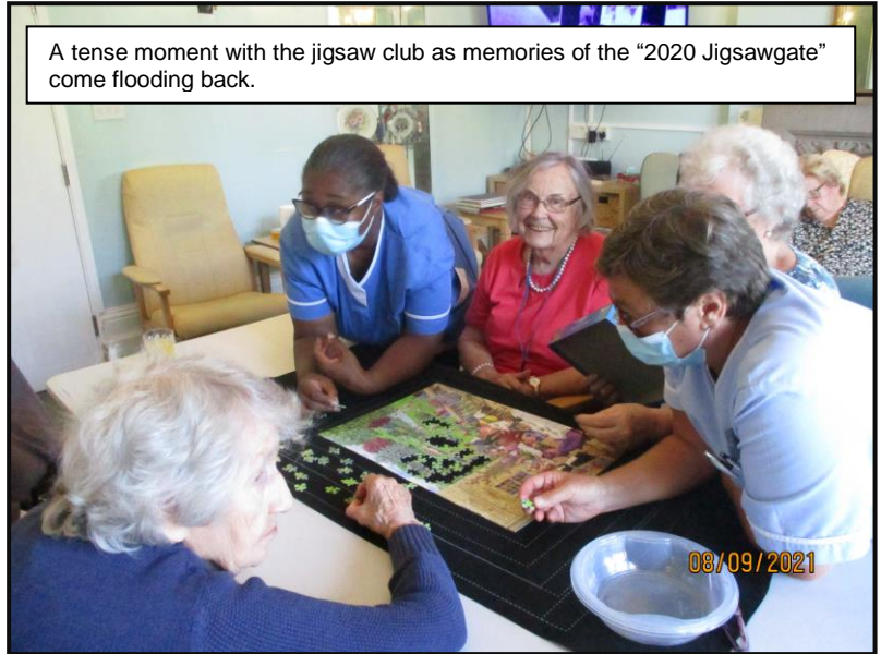
A tense moment with the jigsaw club as memories of the "2020 Jigsawgate" come flooding back.