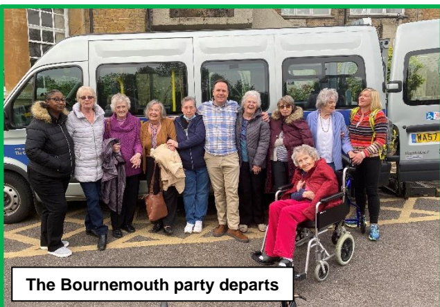
The Bournemouth party departs