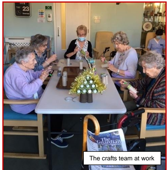
The crafts team at work