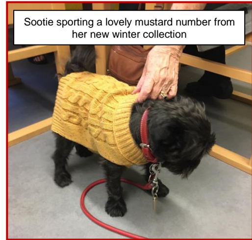
Sootie sporting a lovely mustard number from her new winter collection