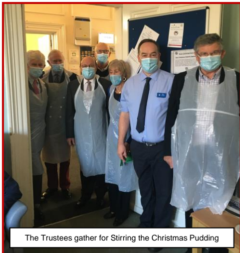
The Trustees gather for Stirring the Christmas Pudding