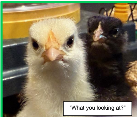
"What you looking at?"