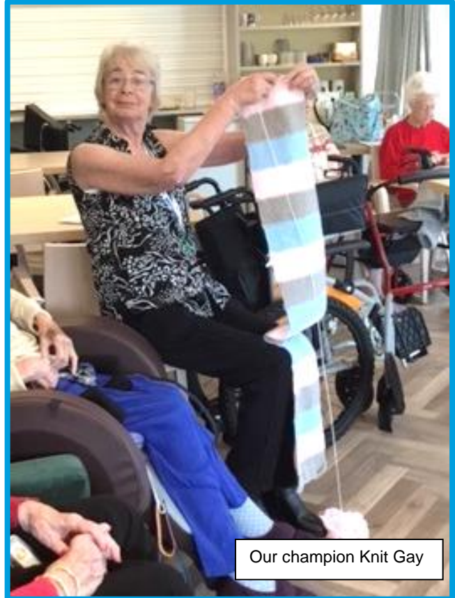
Our champion Knit Gay