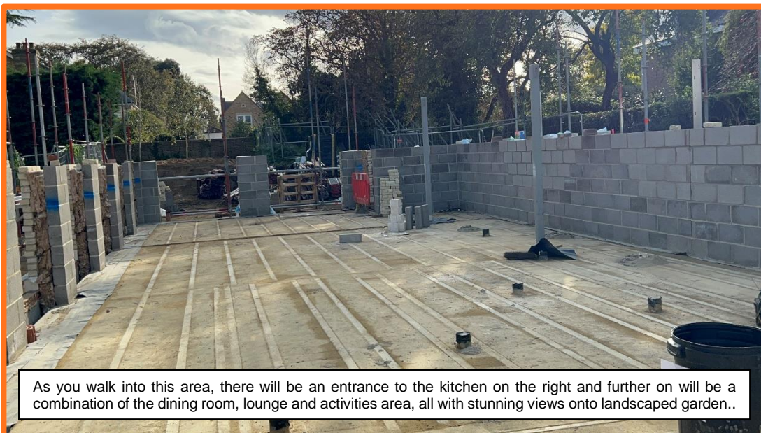
As you walk into this area, there will be an entrance to the kitchen on the right and further on will be a combination of the dining room, lounge and activities area, all with stunning views onto landscaped garden..