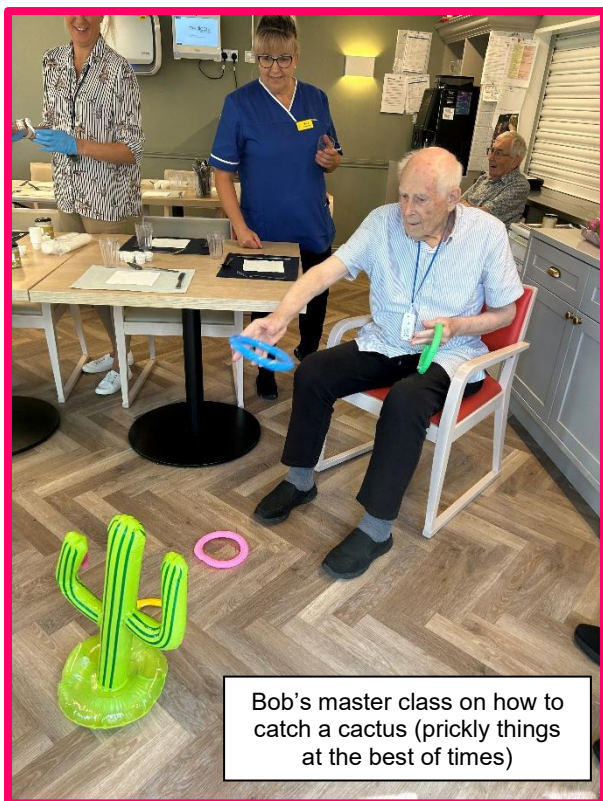
Bob's master class on how to catch a cactus (prickly things at the best of times)